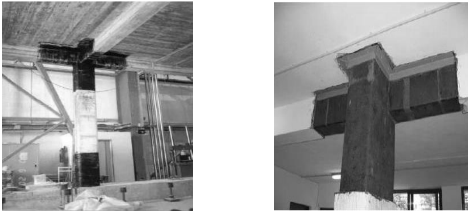
Figure 3. Retrofitting of RC beam-column joints with FRP (Tsionis et al. 2001 and Motavalli and Czaderski 2007).

The FRP strengthening system for RC beams can be made more effective by prestressing the fibers. The most beneficial effects of the prestressing method are delaying the crack formation, filling the cracks in structure with existing cracks and enhancement of the members shear capacity due to the action of confinement and reduction of FRP associated costs, because the same strength levels reached with nonprestressed composites can be reached with pretensioned sheets of reduced area (Triantafillou et al. 1992; El-Hacha 2003; and Millar et al. 2004). Thus, the serviceability of beams strengthened with FRPs is improved when the sheets or laminates are prestressed. However, codes and guidelines of applying pre-stressed FRP are not yet fully established. The prestressing techniques and installation methods need to be further