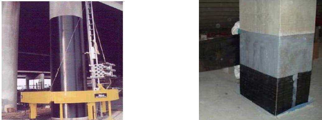
Figure 2. Application of FRP for seismic retrofitting of RC columns

When an earthquake hits, reinforced concrete columns are considered to be the most vulnerable part of a typical RC structure as they are the major load carrying element of the building. Minimum cross section size and lack of steel reinforcement in under designed columns leads to a weak column—strong beam construction. It is very important to strengthen the columns so that the plastic hinges are formed in the beams since it allows more effective energy dissipation. Moreover, columns should be adequately designed to avoid a soft story collapse of a building due to seismic action.